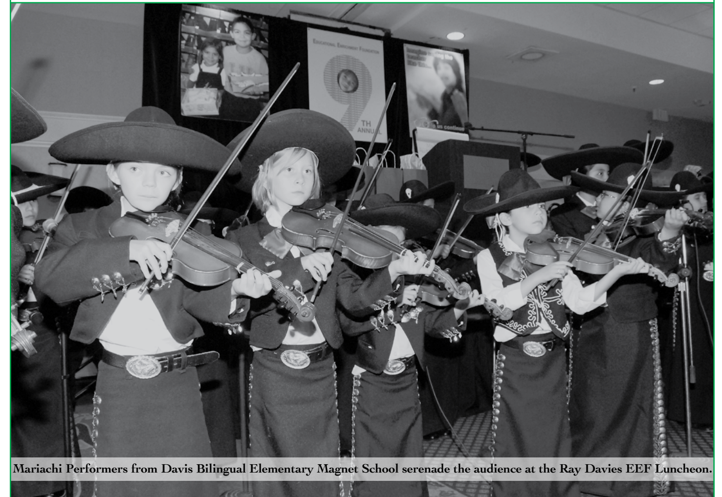
Mariachi Performers from Davis Bilingual Elementary Magnet School serenade the audience at the Ray Davies EEF Luncheon.

News from the Educational Enrichment Foundation